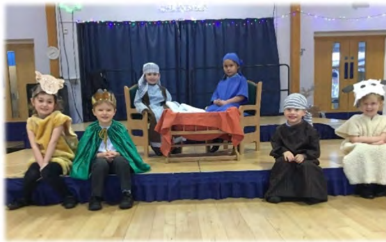
Reception children at The Round House proudly present their Nativity play

Merry Christmas and a Happy New Year from everyone at the Diamond Learning Partnership Trust!